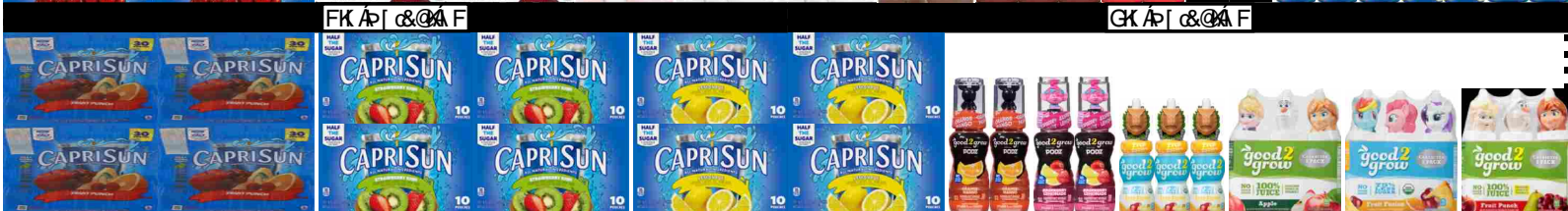
FK A| &@A G