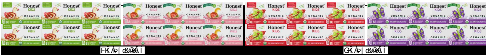
FK A| &@A |