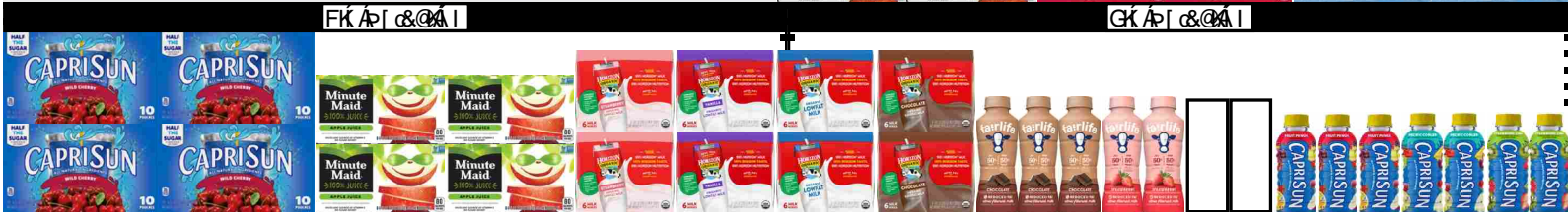
FK A| &@A F