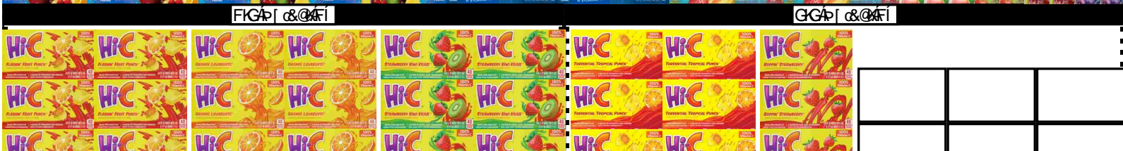
FK A| &@