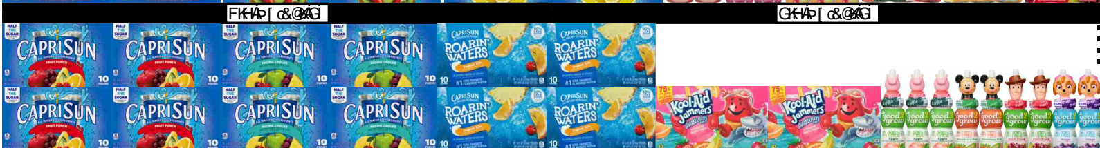
FK A| &@A F